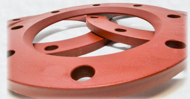
Plate Steel Rings (IPS)

Material ASTM A36 plate steel with a 45 degree Chamfer/Radius; AIS compliant